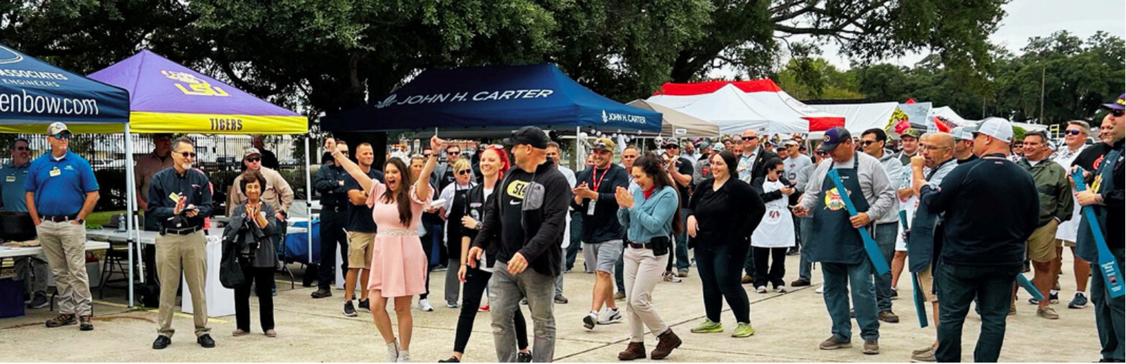
Chalmette Refinery's Battle for the Paddle benefiting United Way of Southeast Louisiana