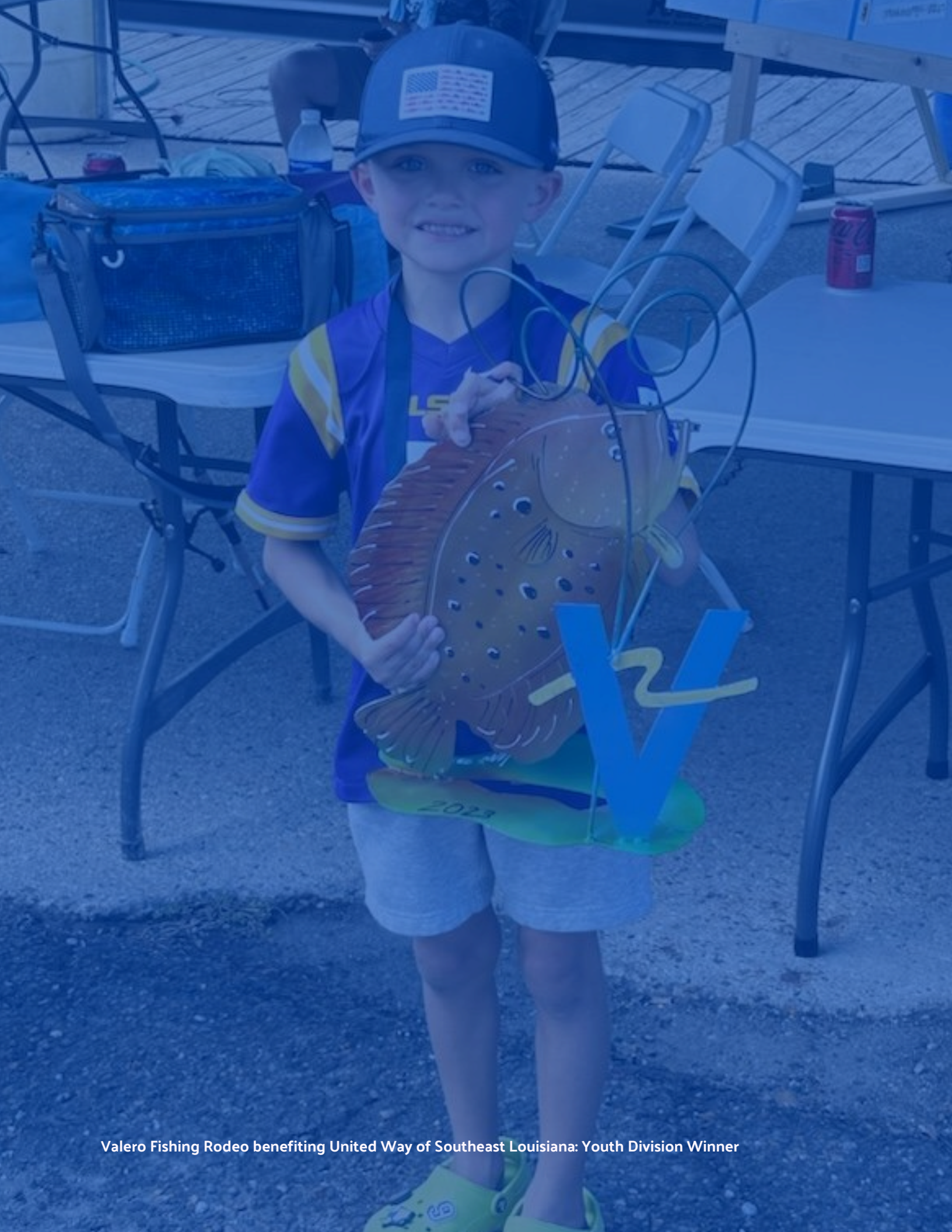
Valero Fishing Rodeo benefiting United Way of Southeast Louisiana: Youth Division Winner