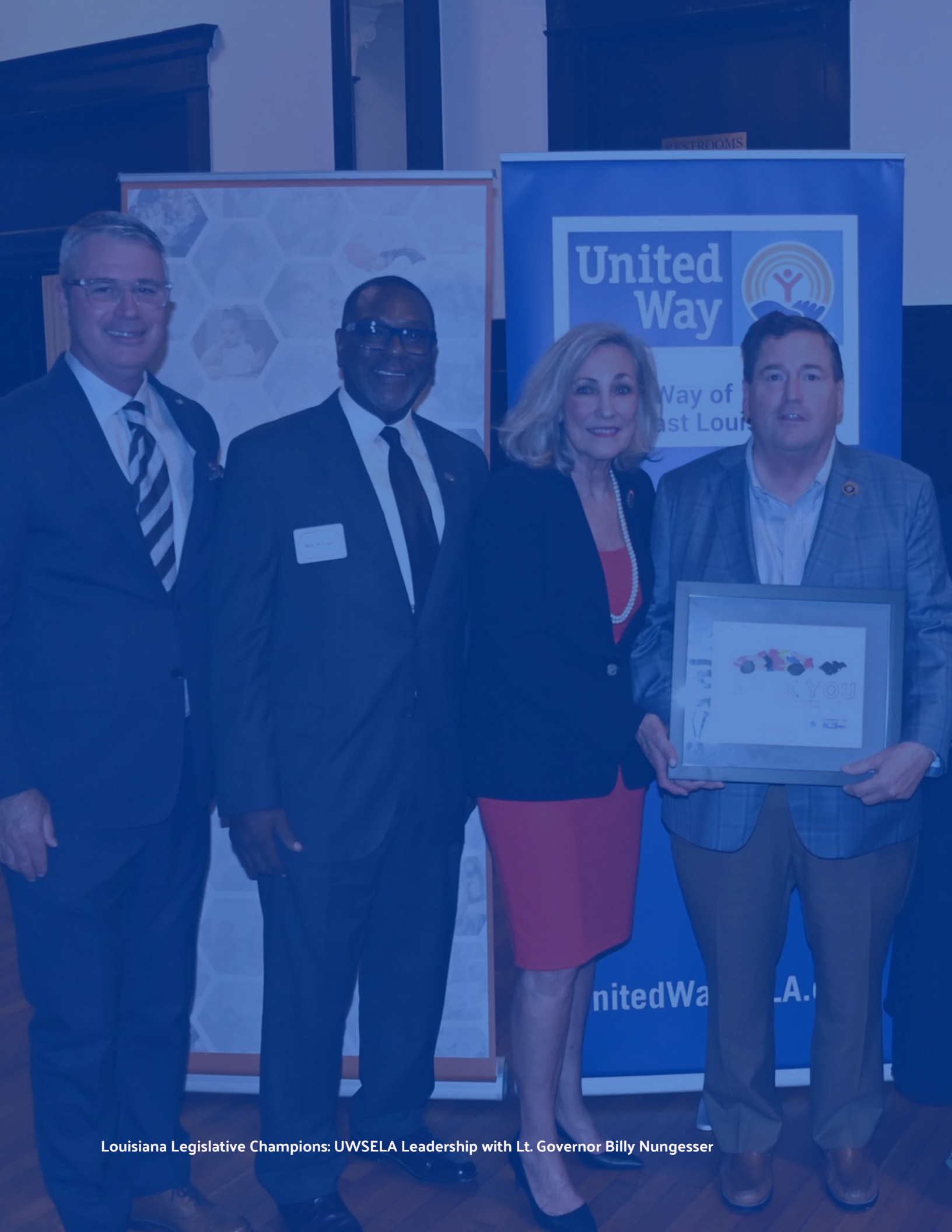
Louisiana Legislative Champions: UWSELA Leadership with Lt. Governor Billy Nungesser