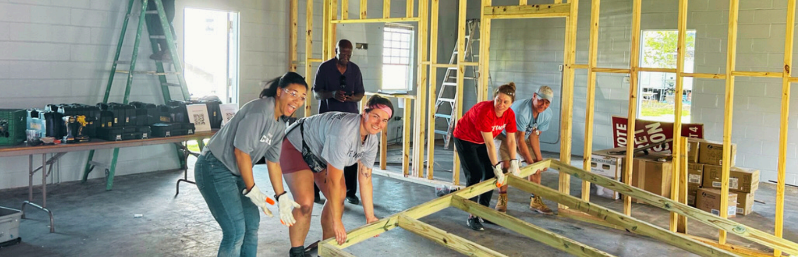
Zachry Volunteer Day