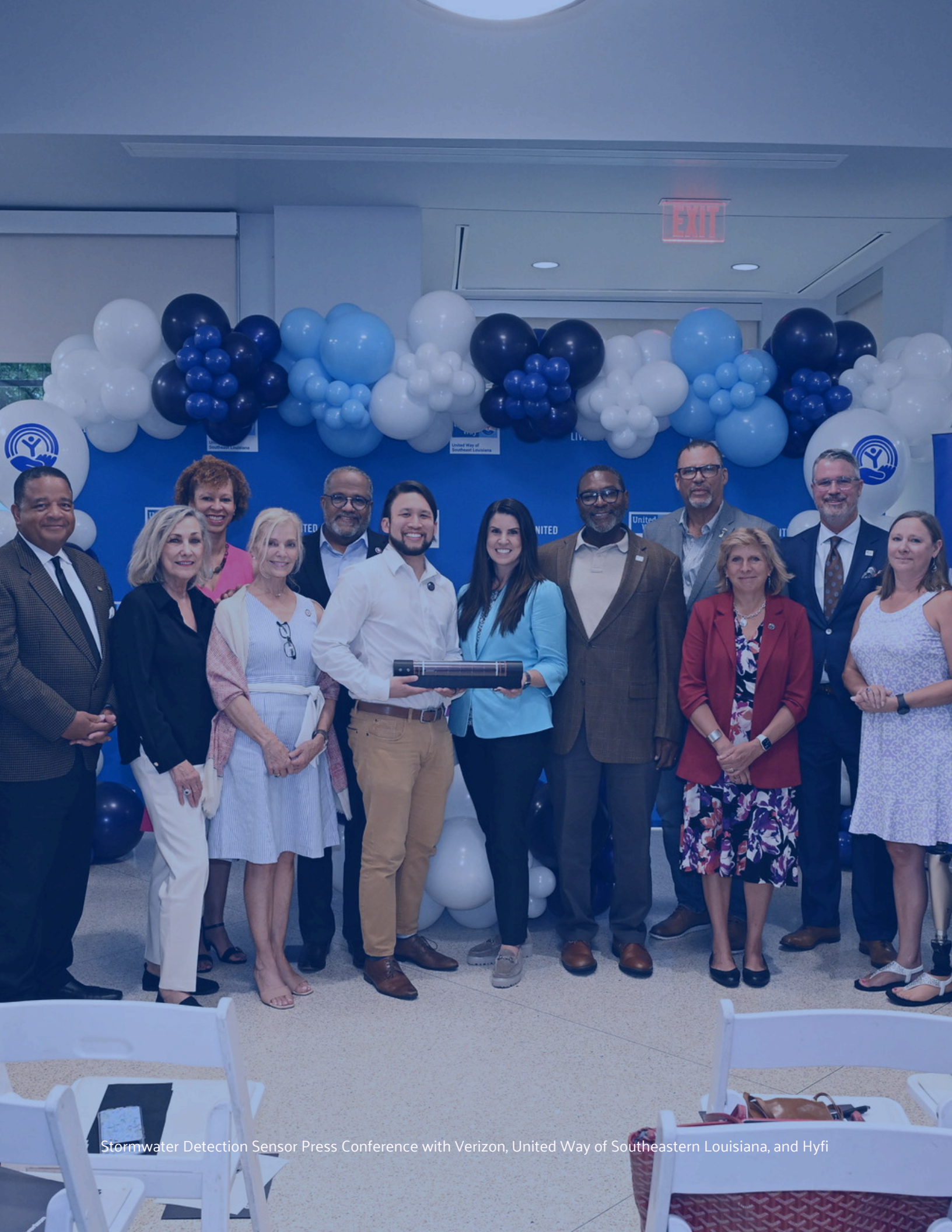
Stormwater Detection Sensor Press Conference with Verizon, United Way of Southeastern Louisiana, and Hyfi