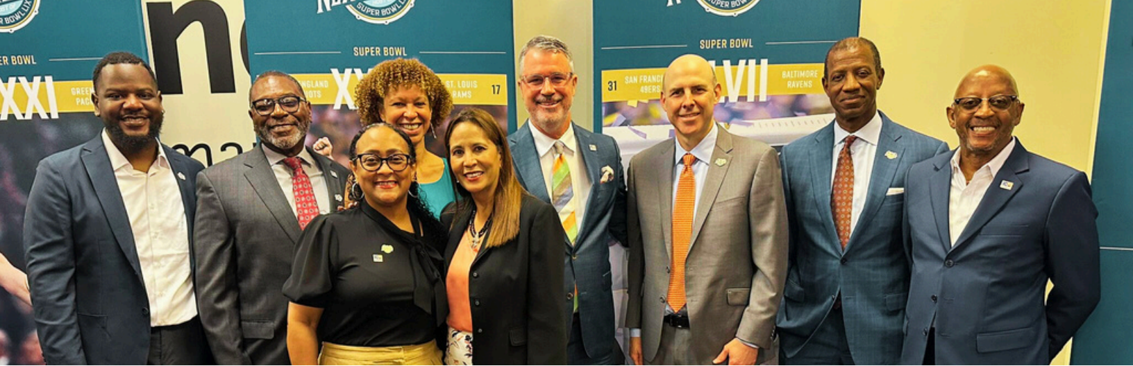
Super Bowl LIX Legacy Impact Press Conference