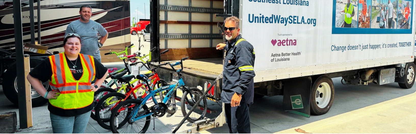
Cummins Volunteer Day