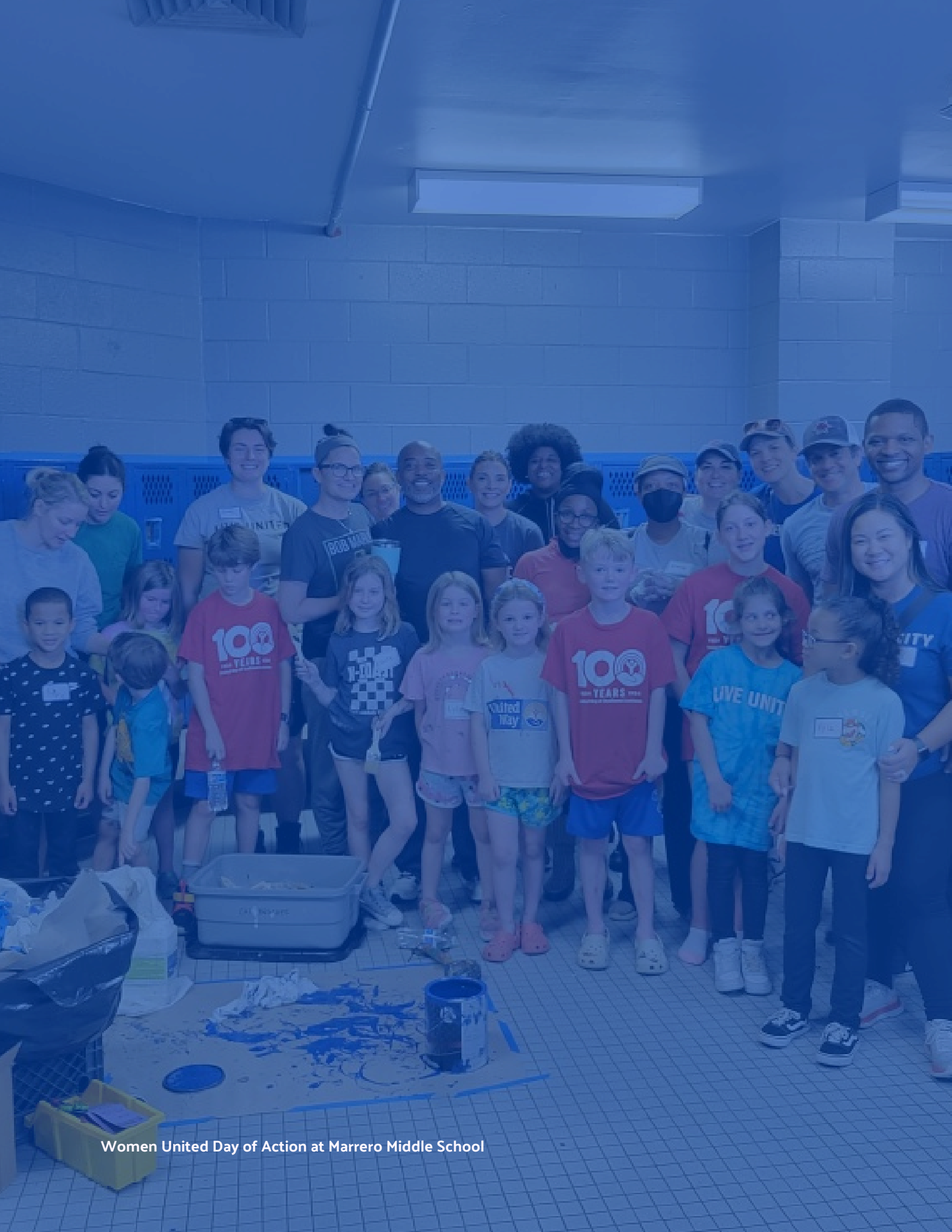
Women United Day of Action at Marrero Middle School