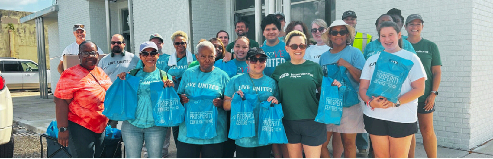
UWSELA Prosperity Center- Bogalusa Campus: Outreach Volunteer Day