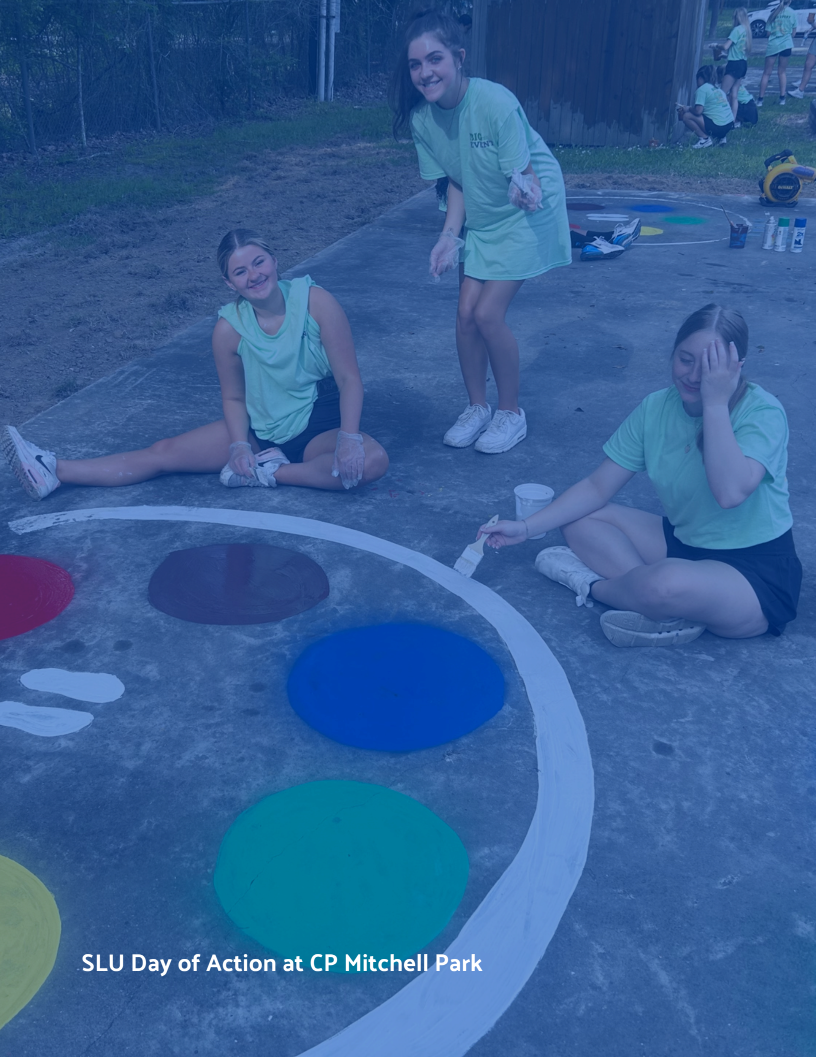
SLU Day of Action at CP Mitchell Park